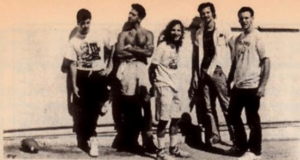
by Mikhail Bohonus